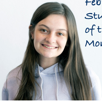
February Student of the Month